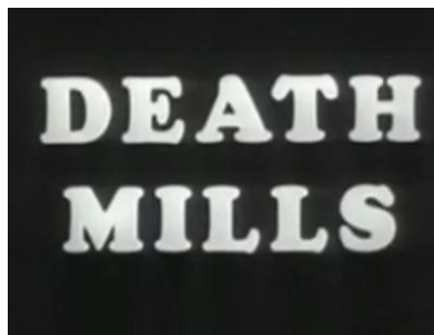
Information Control Film Still

Times ran a front-page article beginning with "Nazi Death Factory": because the Information Control Department is influencing everybody. And as much as Information Control would like to demonstrate a tie-in to German industry, their logic is flawed because even according to the standard holocaust story, the holocaust happened in the East in areas taken by the USSR at the end of the war. Yet these films